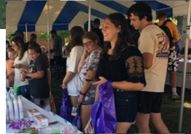
ECC Back to School Bash