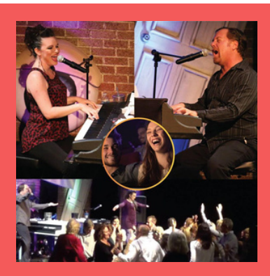
Dueling Pianos Estes Park July 1st 6-9pm