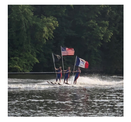
Waterhawks Ski Club Riverbend Park July 4th 7-8:30PM