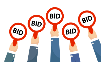
Community Auction Estes Park July 1st 1-2PM

Jefferson Hwy Tour Group Stopping in Iowa Falls June 6-7