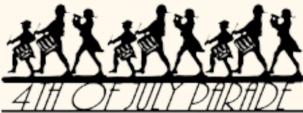
Annual Parade, Monday, July 4, 5pm