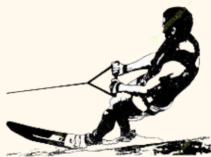
Waterhawk Ski Club, Monday, July 4, 7pm