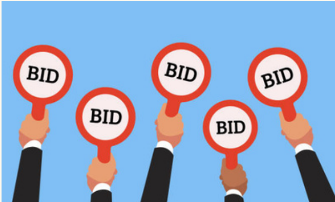
Community Auction, Sat, July 2, 2pm