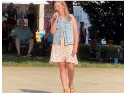
Bill Riley Talent Show Saturday, July 2nd, 3pm-5pm