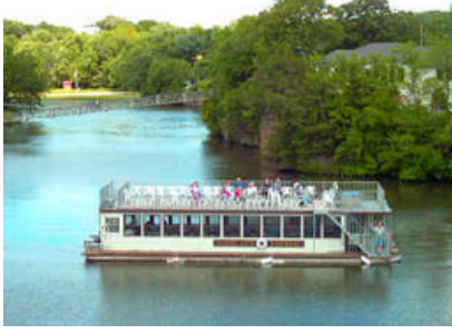
Scenic City Empress Boat Public Boat Cruises Every Sat & Sun @ 2pm