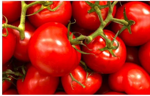
Pastime Players present "A Bad Year for Tomatoes" Iowa Falls Community Theatre 510 Stevens Street Fri, June 17 @7pm Sat, June 18 @7pm Sunday, June 19 @2pm