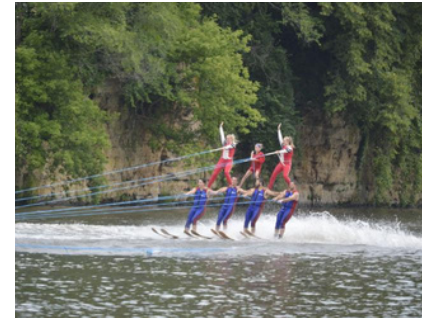
Waterhawks are coming July 4th 7pm-8:30pm

IOWA FALLS CHAMBER MAIN STREET supports on going economic growth and promotes a community of upper-story living, thriving businesses and unique dining and retail establishments. Nestled along the scenic Iowa River with our many public parks and historically preserved downtown with refreshed streetscape, we have the perfect blend making Iowa Falls and our historic Main Street District a desirable visitors' destination and the quality community we call home.