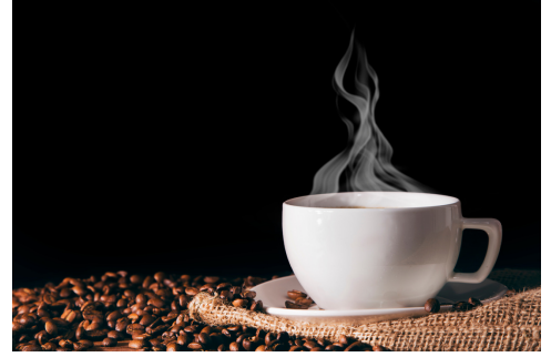
Next Chamber Member Quarterly Coffee July 20th