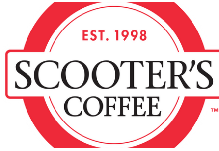
Welcome Scooter's Coffee Opening Monday, June 6th