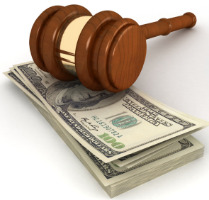
Community Auction Saturday, July 2nd, 2pm-3pm